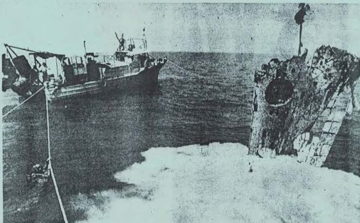
A diver holds a line as the wing of a Grumman Avenger airplane is lifted last week from the sea near Key West, Fla. Salvors say the plane may be one of five Navy aircraft that disappeared more than 40 years ago while on a routine flight.