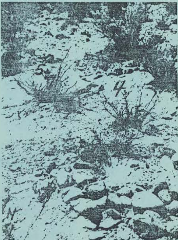
Landing marks.